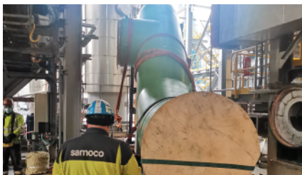
Manipulation and mounting of 18T pipe part in self-engineered chair at Air Liquide Antwerp