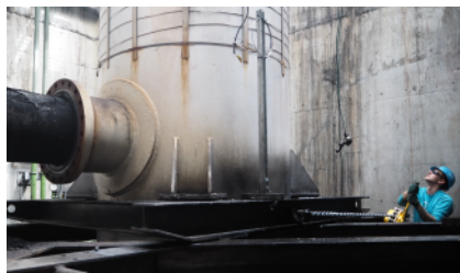
Installing equipment at Imerys Willebroek