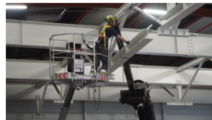
Mounting of a steel structure at Asco Zaventem

Solve it with skill. Tackle it with passion.