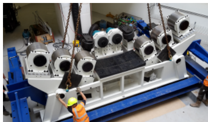
Mechanical installation of proton therapy cyclotron and gantries at Aarhus hospital, Denmark