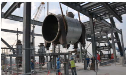
Equipment erection at Lanxess Antwerp