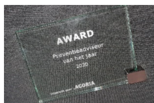
Belgian Health & Safety Manager of the year 2020 award (Agoria)

Living by these guidelines have not only provided us with excellent safety statistics but also earned us a number of important awards that are recognised throughout the industry: