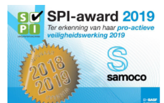
BASF Safety award 2018 & 2019