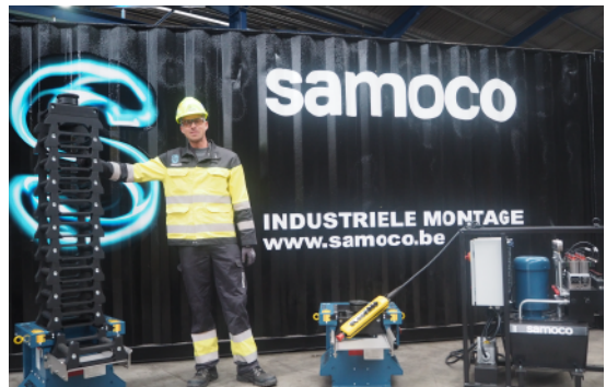
JACKING SYSTEMS IN VARIOUS CAPACITIES