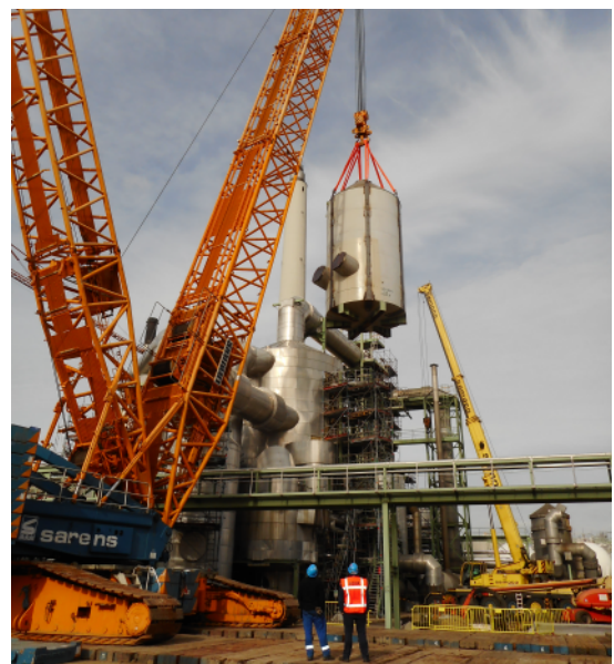
SARENS GROUP EQUIPMENT: CRANES, BARGES, SPMT'S, SKIDDING AND JACKING EQUIPMENT