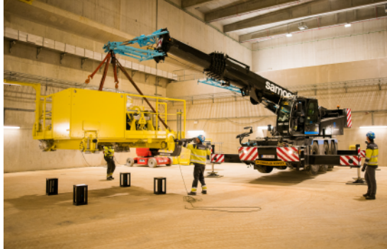
HYDRAULIC CRANES 25T - 130T

INVESTING IN OUR OWN LIFTING AND SHIFTING EQUIPMENT MAKES US ABLE TO STAND OUT FROM OUR COMPETITION.