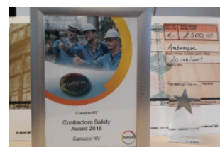
Covestro Safety award 2018