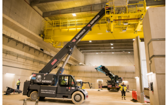
ELECTRICAL PICK & CARRY CRANES 3T - 60T