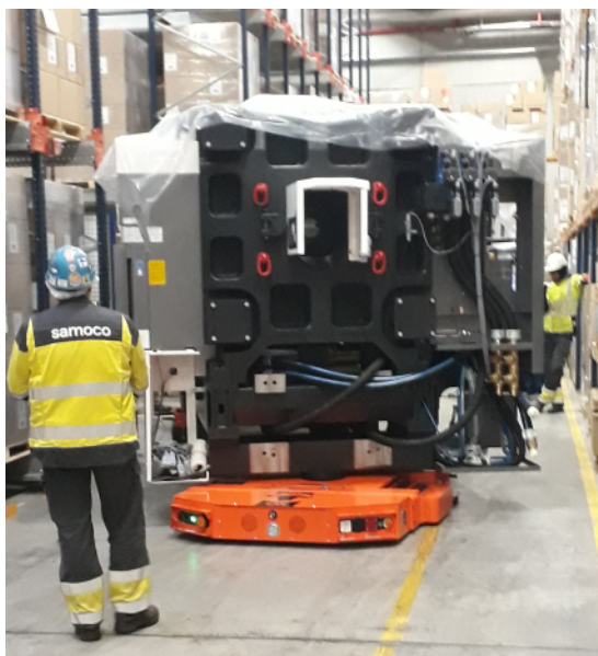
SELF-PROPELLED TROLLEYS UP TO 80T