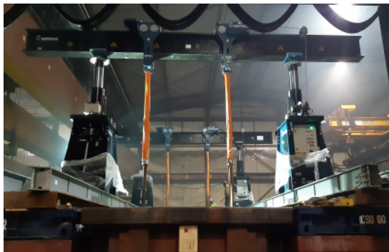
HYDRAULIC GANTRIES 200T - 800T