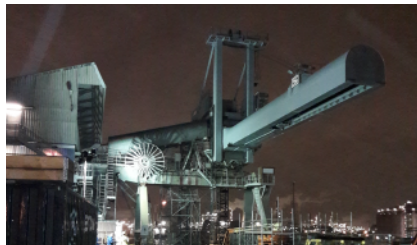
Complete Overhaul Conveyor