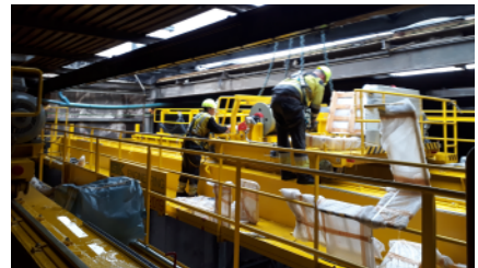
Erection of new cranes