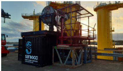
Cable Change at TITAN 700 TONS crane