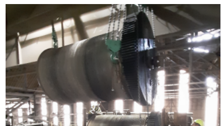
Revision of hoisting Drum 300T casting bridge

Solve it with skill. Tackle it with passion.