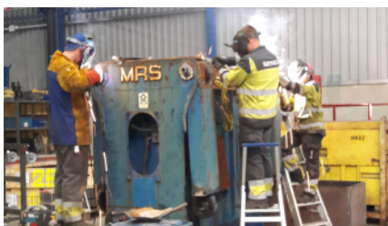
Repairing a Grab Mobile Harbour crane