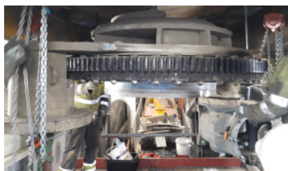
Replacement of a Slewing Bearing